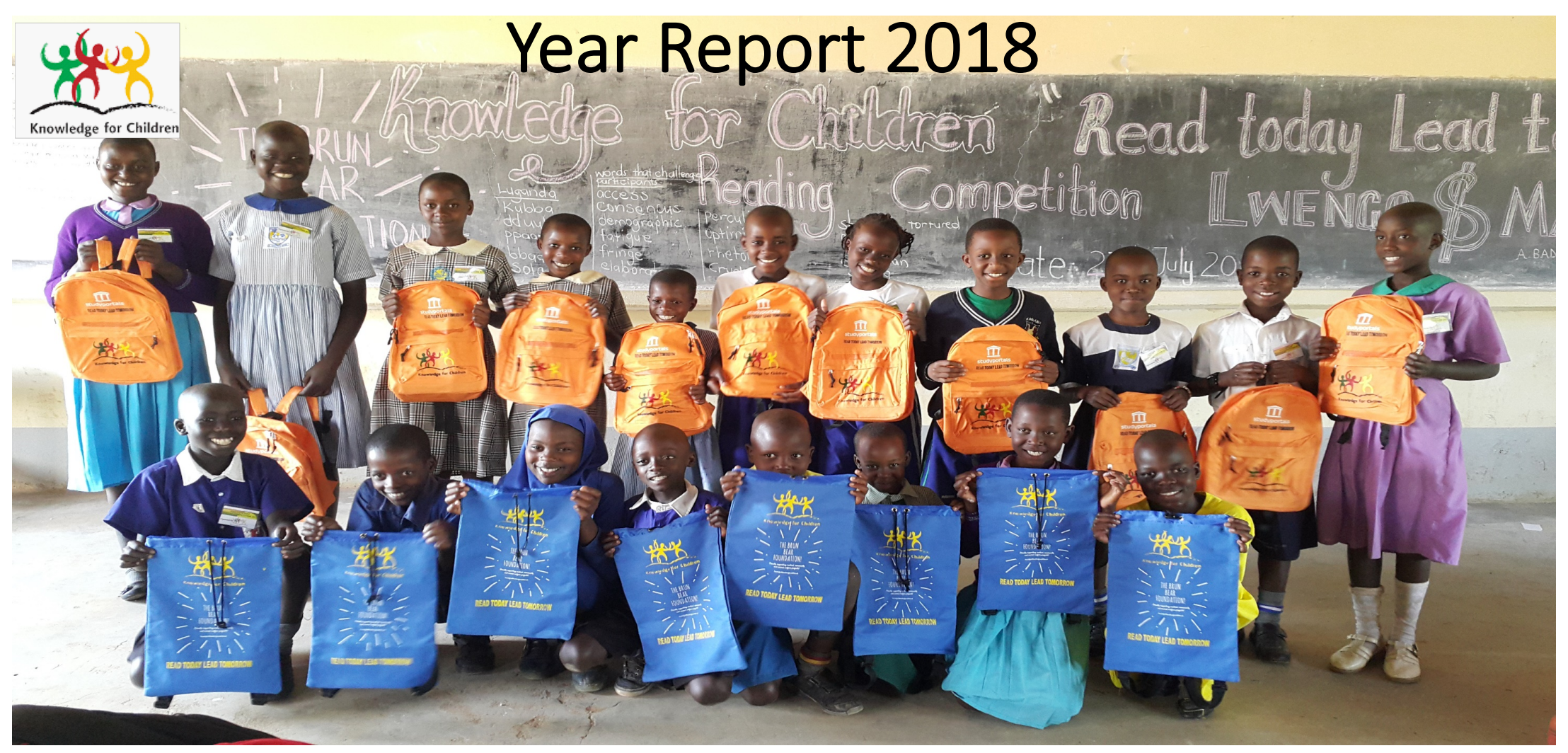
In 2018 we have reached:

47,659 children with 18,484 books at 113 schools and 1,525 teachers plus 518 student teachers